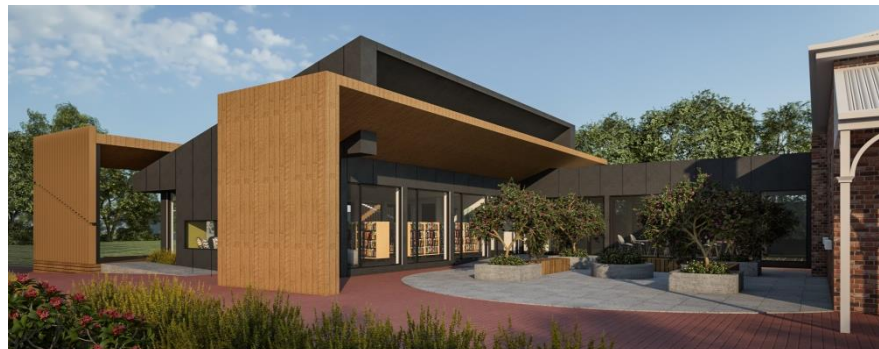
Below, an artist's impression of the new Library.