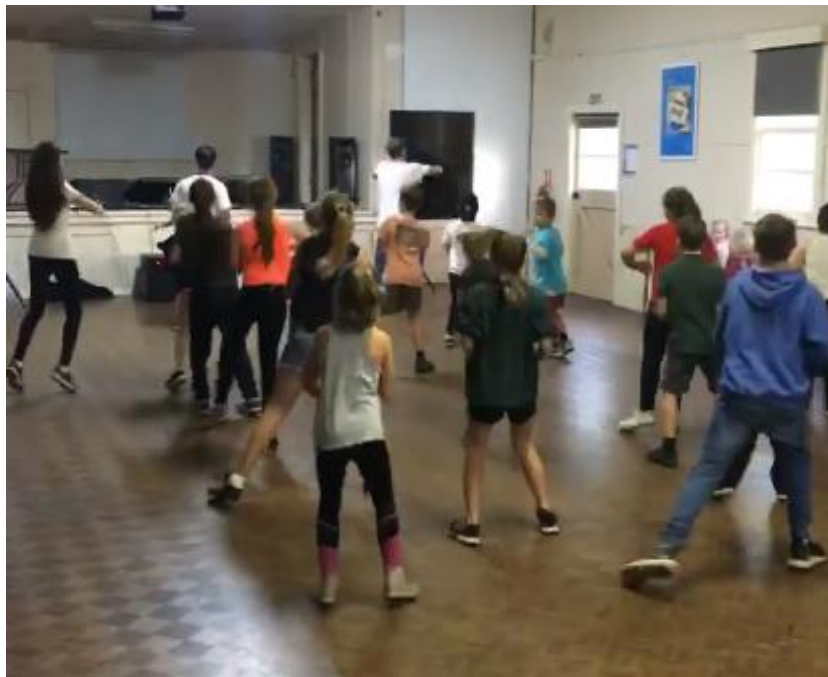
Pictured: Dimboola hip hop workshop.