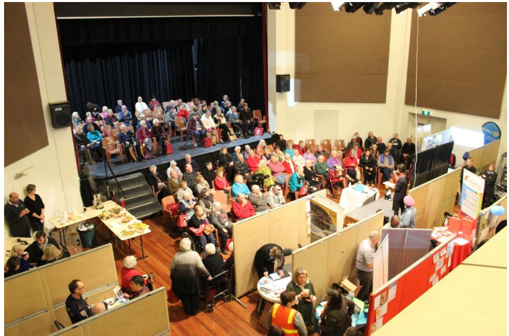
Pictured above: audience at the Health & Wellness Expo 2019

Attendees at the Expo heard from 15 speakers who presented a range of topics and were able to discuss various health and wellbeing related issues with representative of nearly 30 companies and organisations that had displays in stalls.