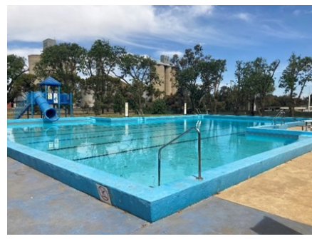
Jeparit Swimming Pool