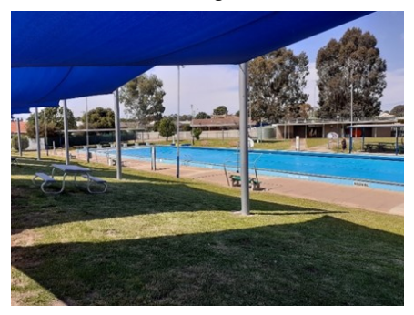
Rainbow Swimming Pool