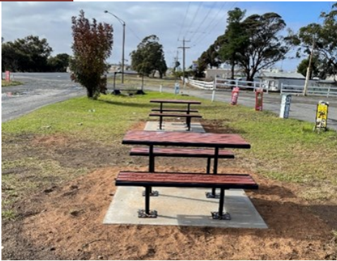
Above: Street Furniture at Nhill BP Roadhouse.

Teams in Jeparit, Rainbow and Dimboola have finished installation of street furniture as well. They have been undertaking tree trimming around Tarranyurk and grading in the Rainbow Pullet area, moving to the Jeparit area next for more grading maintenance works.