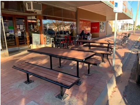
Above: Street furniture in front of the Dimboola Bakery