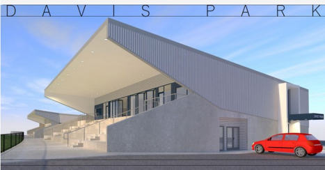
Please note: this image is an artist's impression and is subject to change.

We encourage residents from Nhill and district who are interested to call into the drop in session.