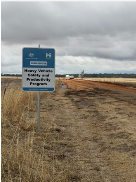
Kiata North Road

The crew are also completing a gravel road re-sheet on P Warners Road to improve all weather access in the area. This seasons road construction program is large due to success in receiving several grants.