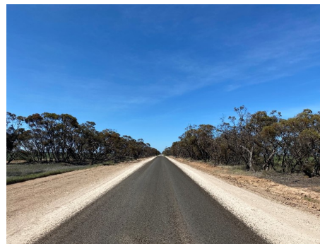
Pigick Bus Route Rd (above).

Works on Pigick Bus Route Road is finished and sealed. Two small sections were repaired returning to a 4m wide seal. These works are near Schillings Rd intersection.