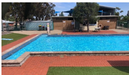
Above: Jeparit Swimming Pool