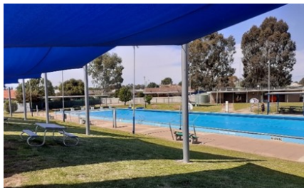
Above: Dimboola Swimming Pool