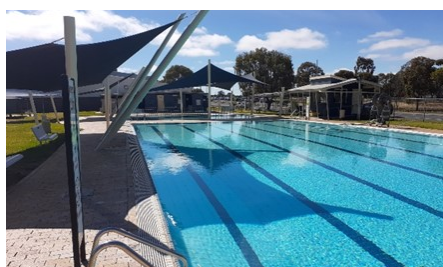
Above: Nhill Swimming Pool

Dimboola has a solar heated 50m x 13m size lane pool, a toddlers' pool. Rainbow has a 25m T shaped six lane pool, toddlers pool. Jeparit has a solar heated 20m x 9m pool, a toddlers' pool. All facilities have plenty of seating and shaded picnic areas along with toilet/shower amenities.