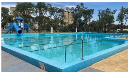
Above: Rainbow Swimming Pool