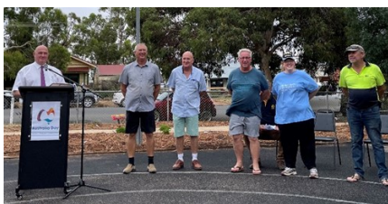
A few members of Rainbow Desert Enduro Working Group receiving their Community Event of the Year award in Rainbow on Australia Day.