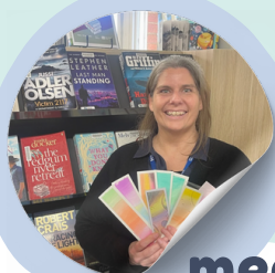
meet Danelle NHILL LIBRARY