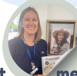
meet Adelle DIMBOOLA LIBRARY