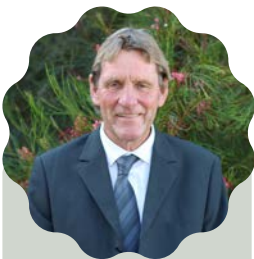
Cr Brett Ireland Mayor

Alternatively, you can contact them via email to info@hindmarsh.vic.gov.au and put the Councillor name(s) in the subject line.