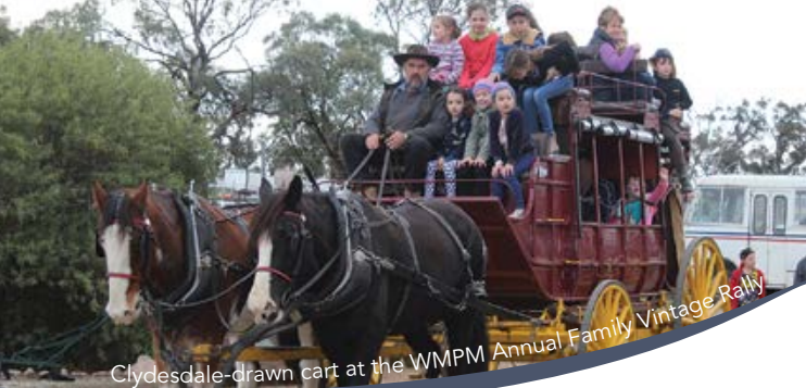
Clydesdale-drawn cart at the WMPM Annual Family Vintage Rally

The Wimmera Mallee pioneer Museum has a wonderful collection of original buildings from the region, all preserved in their original layout. These house a vast collection of household items, tools, and artefacts from the era, telling the story of Jeparit's history and the people who shaped the area. The main entrance of the Museum is a beautiful homestead known as Brierly House. There is also Albacutya Homestead, Werrap Hall, Tarranyurk Hall, Woorak Church, Detpa State School, a chemist, and a blacksmith's shop on the grounds of the site. There is the H.V. McKay shed, a harvesting machinery shed, lockups, and many more sheds and areas to explore.