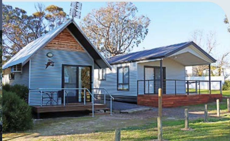
Cabins at the Jeparit Caravan Park