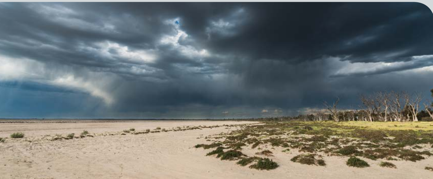
Lake Hindmarsh Four Mile Beach

Many hours, even days, can be spent exploring the amazing flora and fauna surrounding Lake Hindmarsh.