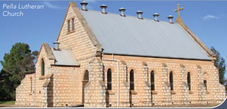
Pella Lutheran Church

German settlers from South Australia and landholders near Jeparit soon made their way to the district.