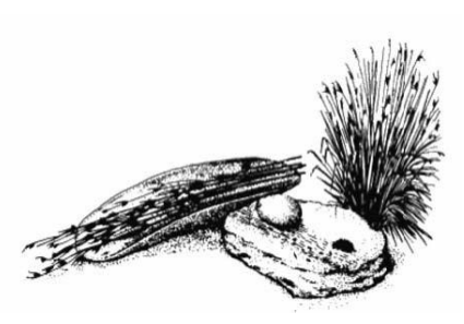
"If we follow Bunjil's law and look after the country then the country will look after us. ... All the rules we have, come from Bunjil. I must pass on Bunjil's law so it continues". The late Uncle

Little Desert is much more than a desert. Camp beside the tranquil Wimmera River fringed with River Red Gums, or hike the rolling dunes of the desert. Wide open spaces and peaceful campgrounds make this park a natural treasure, best seen on foot in autumn, winter and spring. The river end is ideal to visit in summer.